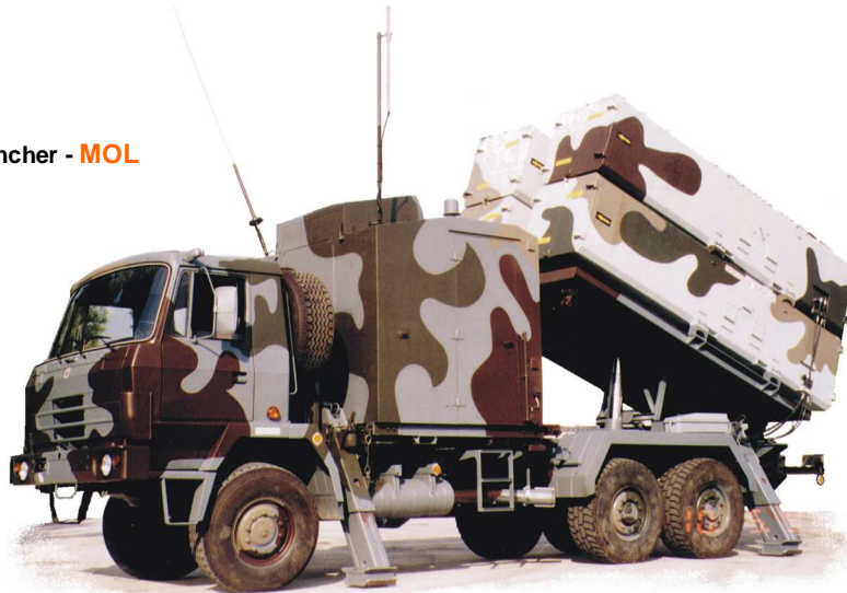
Coastal Mobile Launcher - MOL

FOBOS is compact and fast missile launching control system, that was developed for Saab RBS15B missiles. It can control up to eight missiles, and can be installed on a ship or on a land vehicle.